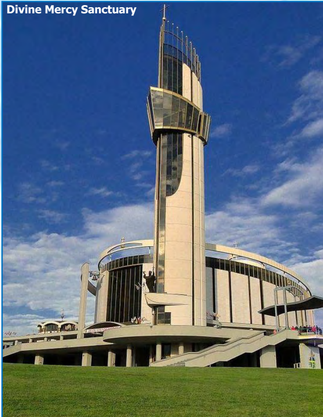
Divine Mercy Sanctuary